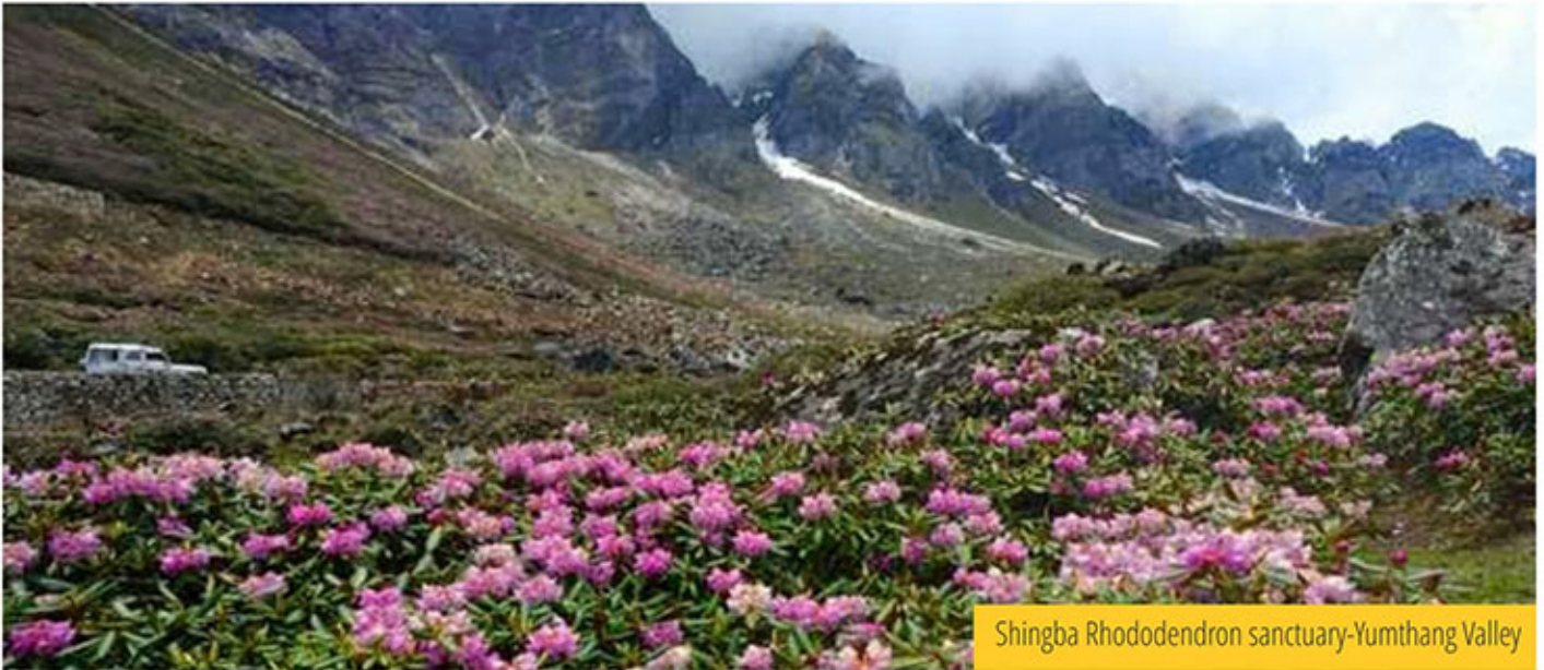
Shingba Rhododendron sanctuary-Yumthang Valley